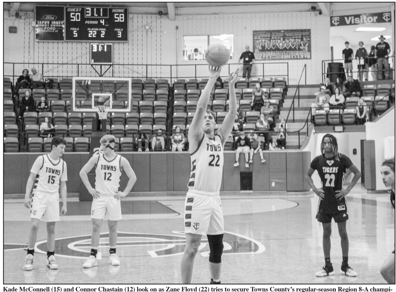
onship last Tuesday night vs. Greene County.

On Friday, Feb. 9, the team played the final game of the regular season against Washington-Wilkes. Despite losing a starter to illness, the Indians won the game 55-47.